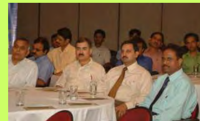
An attentive audience.

Drilling had always been a difficult proposition on all accounts. However, the persistent requirement of effective reservoir drainage has ensured that technology per se has kept on evolving to meet the expectation of the industry and lease new life to pressure depleted fields. In the recent past, drilling technology has fast transitioned from an act of mechanical prowess to the delicacy of fine arts, wherein engineering and chemistry have locked in to achieve almost impossible.